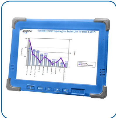
Downtime by time & frequency